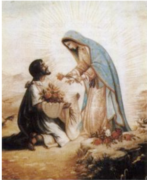
Daily Prayer For Priests